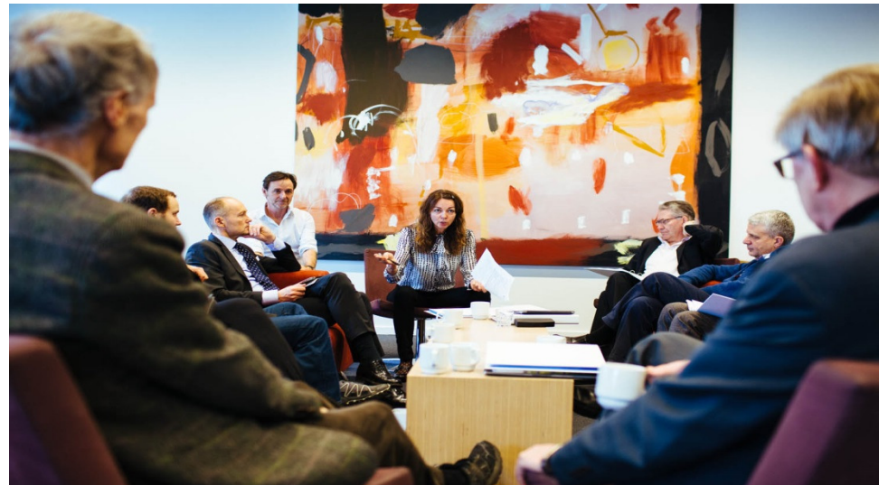
Kickoff-meeting, Snekersten (DK), 18-19 February 2014