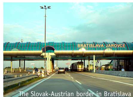
The Slovak-Austrian border in Bratislava

Separated only by 60 km, Vienna and Bratislava are the two European capitals that are closest together. Nearby are also two regional capitals: Győr, in Hungary, and Brno, in the Czech Republic. Between these four countries and around the Vienna-Bratislava axis, cross-border cooperation (known as the " Centropoe region ") has great potential, notably through the