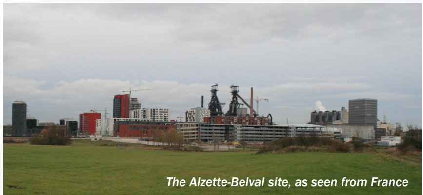
The Alzette-Belval site, as seen from France

At present, the statutes of the EGTC do not provide for contracting authority for procuring works or services, except for studies on mobility, the leading issue for this territory and consequently the first priority of the grouping.