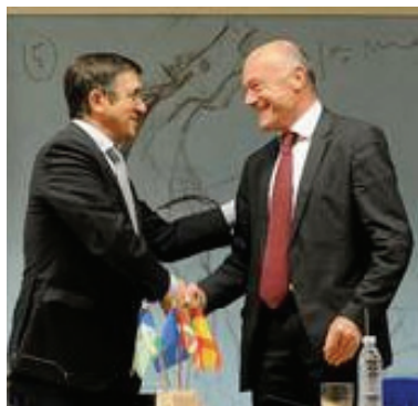
Patxi Lopez, president of the Basque government, and Alain Rousset, president of the Aquitaine regional council, on 12 December 2011.

The Aquitaine-Euskadi Euroregion was launched officially on 12 December in Vitoria, Spain, with the signature of the “Aquitaine-Euskadi” cooperation convention and the statutes for the establishment of a European Grouping of Territorial Cooperation (EGTC).