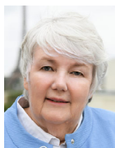
Jacqueline Gourault French Minister of Territorial Cohesion and Relations with Local Authorities