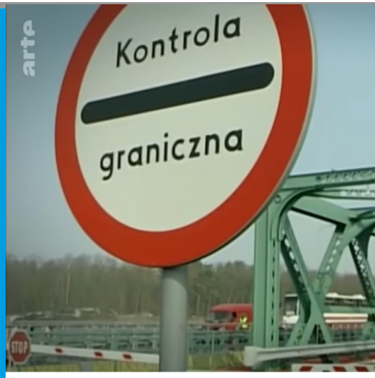
Le retour des frontières | ARTE

More info - Watch the documentary [English]