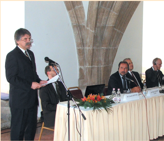
Declaration of Dr. László Kövér, president of the National Assembly of Hungary, during the conference.