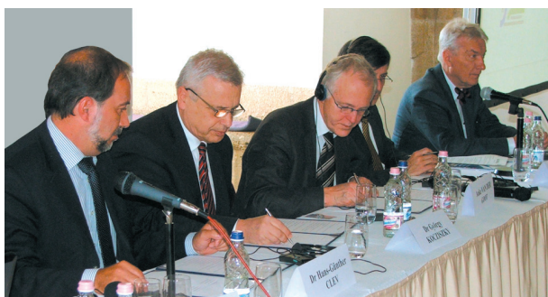
The signature of the Declaration of Budapest

Models of organizing cross-border cooperation already exists in some European countries** and encountered difficulties can be solved in the exchange of