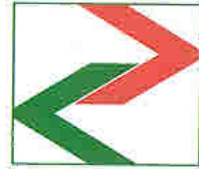
Association of European Border Regions (AEBR)