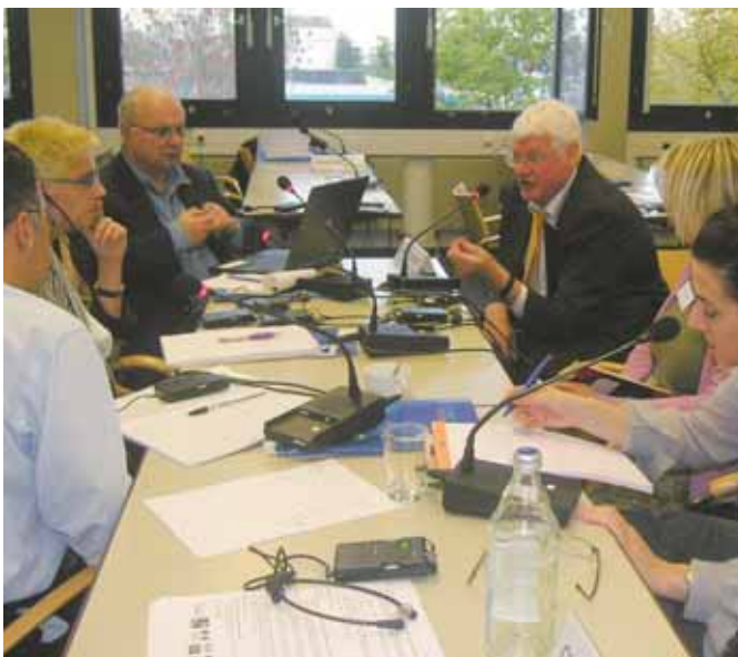
Working group - Interform seminar on setting up projects in public health.

*Mission Opérationnelle Transfrontalière (lead partner), Kehl/Strasbourg Euro-Institut (G), University of Pau and the Pays de l'Adour (F), University of Nice Sophia Antipolis (F), University of Genoa (I), International Institute for Communications, Genoa (I), University of Geneva (CH), University of Deusto (SP).