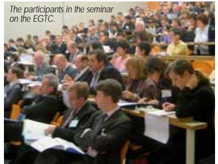
The participants in the seminar on the EGTC.

instrument "with a European dimension" to "formalize their cooperation", "bring together all the competent partners", "define a common strategy" and thus have "greater visibility to the inhabitants" of their territory.