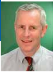
Colin Wolfe, Head of the Territorial Cooperation unit, Directorate General for Regional Policy, European Commission

The implementation of European territorial cooperation co-funded by the European Union will be more successful the better the protagonists of the cooperation are trained. This training is the objective of the Interform project. The development of teaching methods and materials aimed at territorial cooperation protagonists undoubtedly provides added value in the development of cooperation actions on either side of national borders. This project, funded as part of the European Interact programme, should contribute to the European Union's objective of reducing the obstacles that these borders frequently raise to the development of the European territory as a whole.