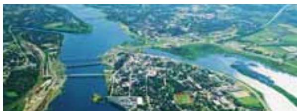
Tornio/Haparanda, twin towns belonging to the City Twins network, on the border between Finland and Sweden.

On 8 November 2007 in Lille, during the European conference "Cross-border territories: day-to-day Europe", the MOT (Mission Opérationnelle Transfrontalière), Eixo Atlantico 1 and the City Twins 2 network are due to sign a cooperation agreement marking their joint decision to establish a European network of cross-border local authorities: EUROMOT.