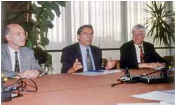
"Cross-border projects in the construction of Europe", conference in Strasbourg, 15 and 16 January 1998.