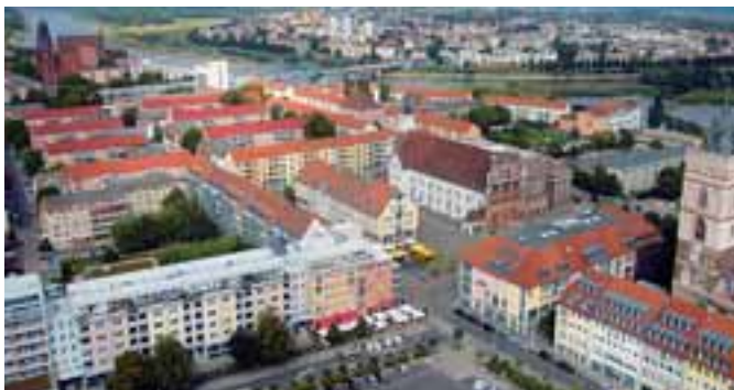
The Frankfurt (Oder)/Slubice cross-border conurbation, on the border between Germany and Poland

Inventory of the advances and new developments for cross-border cooperation in the 2007-2013 European programming period.