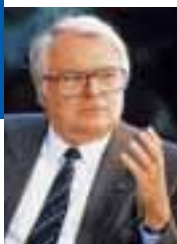
Pierre Mauroy, Former Prime Minister of France, Chairman of the MOT

In a Europe seeking its bearings and good governance in order to face the challenges generated by globalisation, it is useful to fall back on the fundamental meaning of European construction promoted by its founding fathers: to make Europe an integrated space of prosperity and peace for all its citizens. Europe is still too often perceived as an aggregation of nation-states which has difficulty implementing common policies capable of dealing with today's issues, and meanwhile interferes in a nitpicking way in people's daily lives. It is understandable why for some citizens, when asked, that is not the Europe they want!